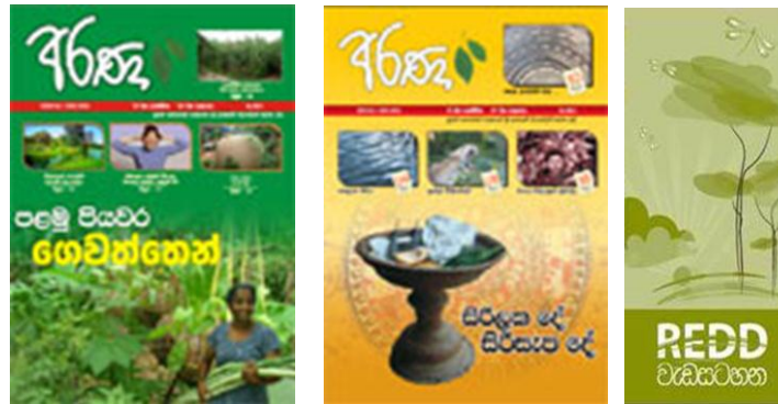
MAGAZINES AND LEAFLETS