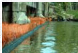
BANANA TRUNK BARRIER DEPLOYED