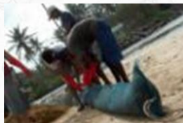
CONSTRUCTING THE BARRIER