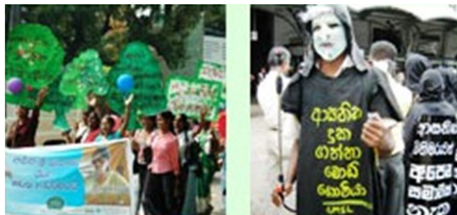
RALLIES AND STREET DRAMA

Areas of operation: All 25 districts of Sri Lanka