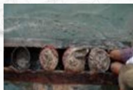
COLLECTING OIL IN SMALL BOATS