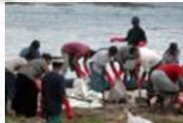
WORKING WITH THE COMMUNITY