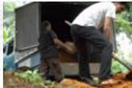
THE TEAM DEPLOYS