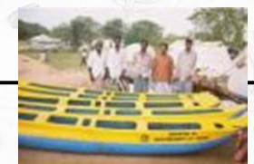
PRIMARY LIVELIHOOD SECURITY