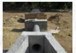
IRRIGATION CANAL CONSTRUCTION