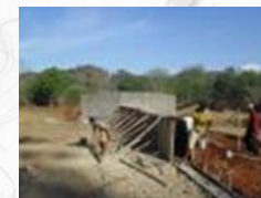
DAM AND SLUICE GATE RECONSTRUCTION