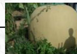
FISHER FOLK IN AGRICULTURE!!

HOLISTIC INTERVENTION AND EFFECTIVE DEVELOPMENT AT ITS BEST