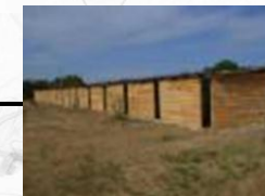
QUICK TEMPORARY SHELTERS